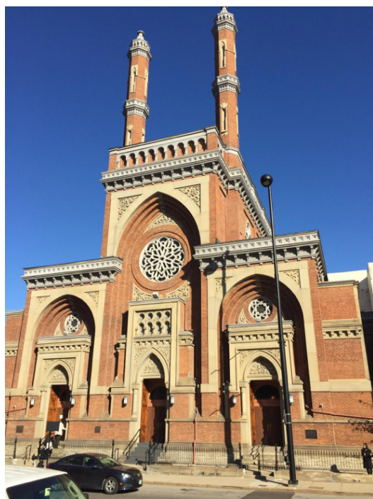
Plum Street Temple, Cincinnati. Flagship of Reform Judaism in USA. Built in 1867 by German Jewish

“End of America's "Andalusian" Golden Age?” on Sunday, January 23, 2022, 3:10-4:00 pm EST @ Limmud Boston eFestival.